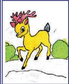
VENNBA U, CL.IV